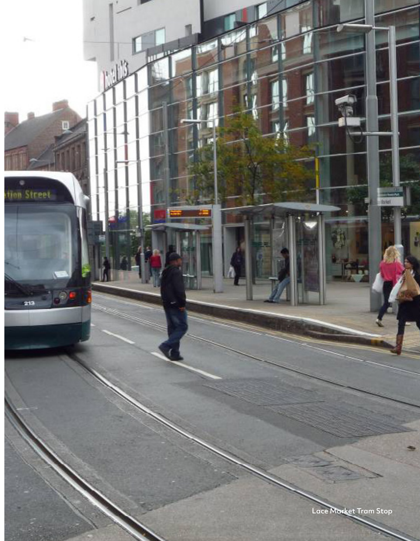
Lace Market Tram Stop