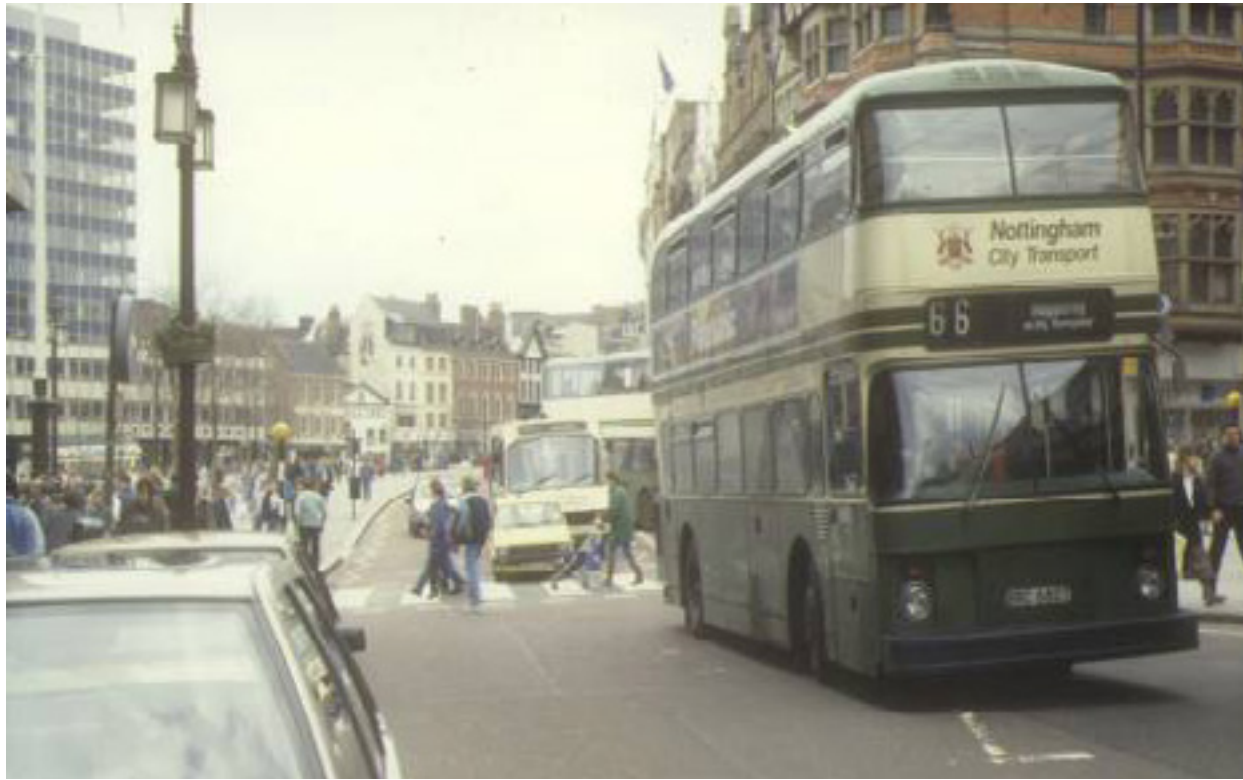
Long Row West / Market Square