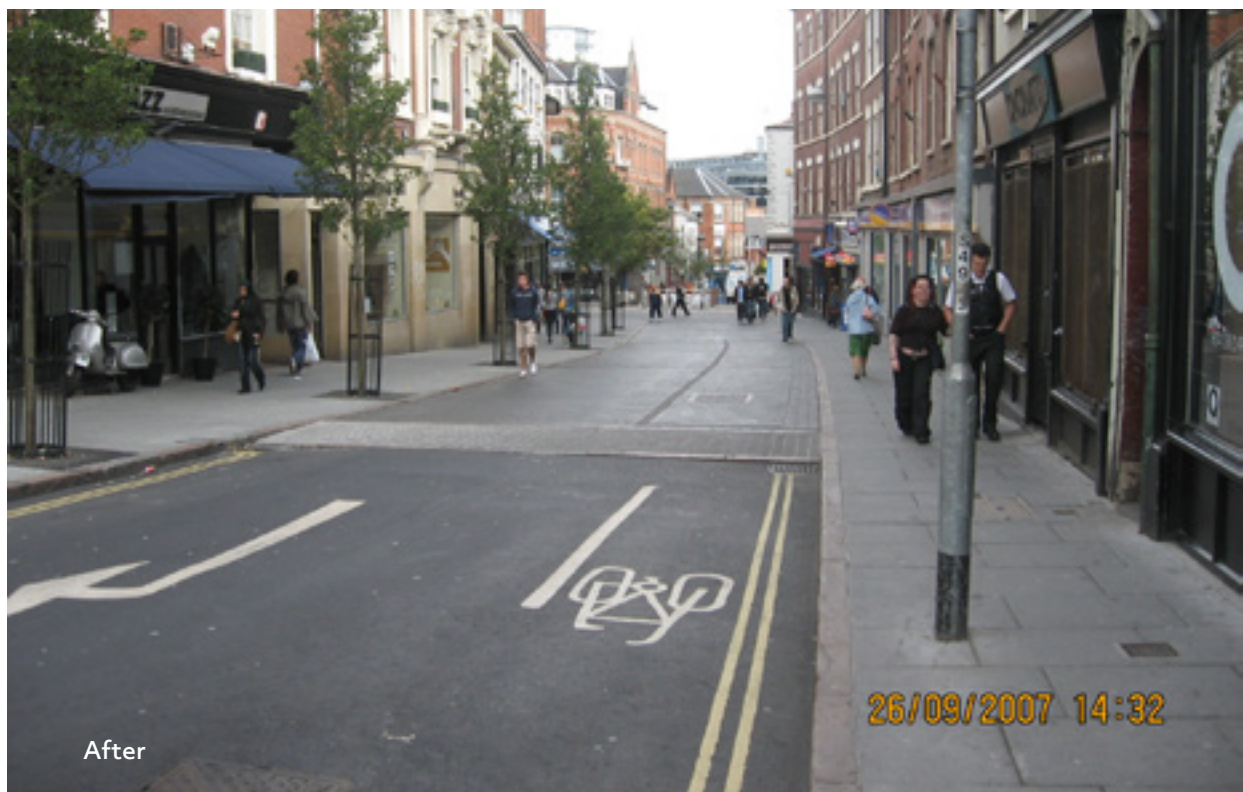
Carlton Street / Goosegate