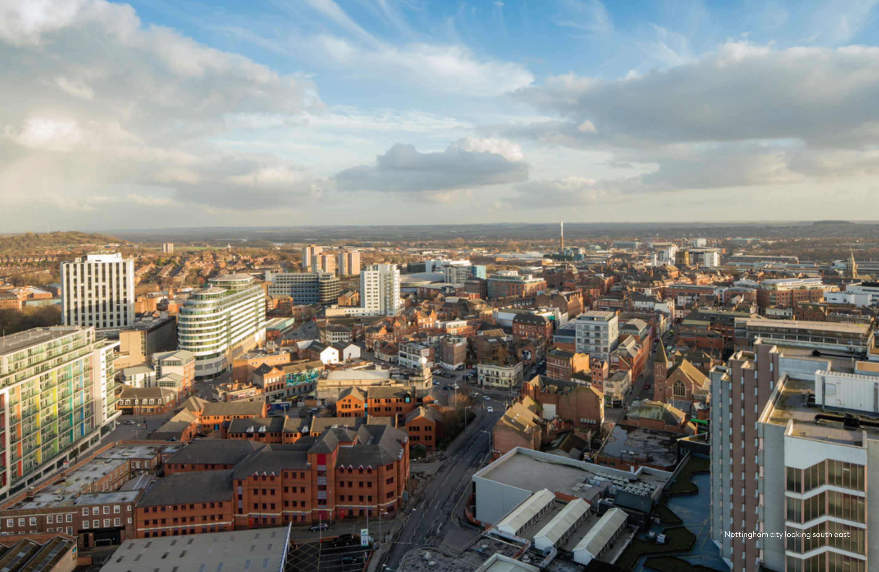
Nottingham city looking south east