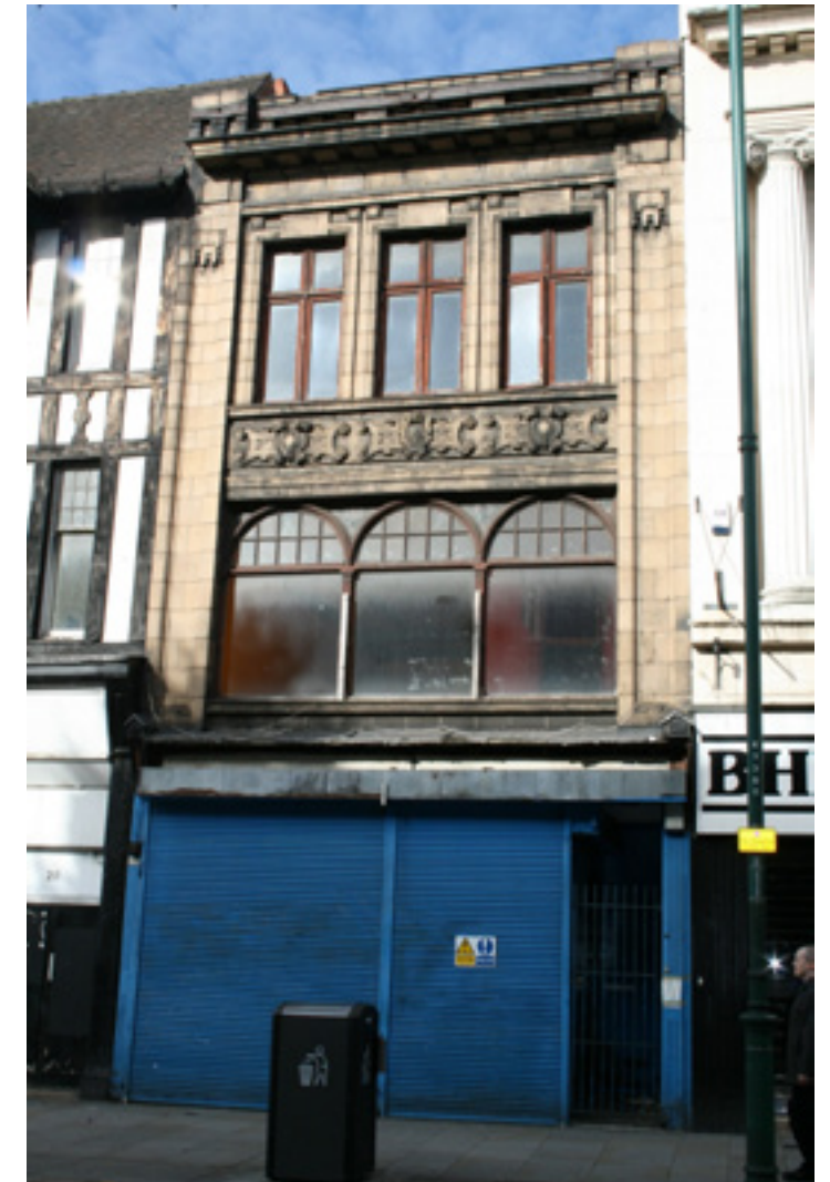
Left: After Right: Before