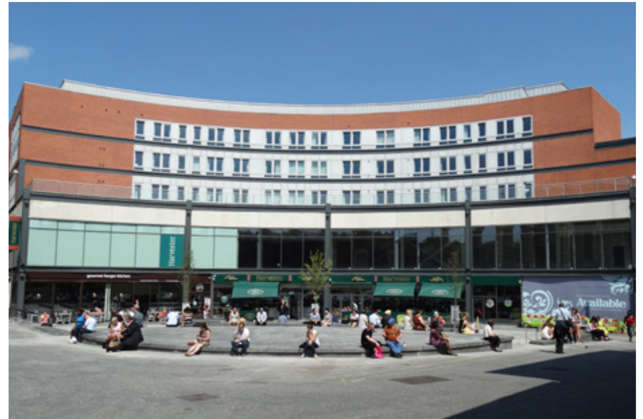
After in 2014