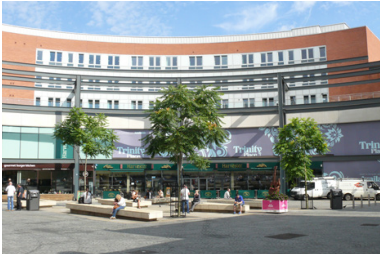
Before in 2013